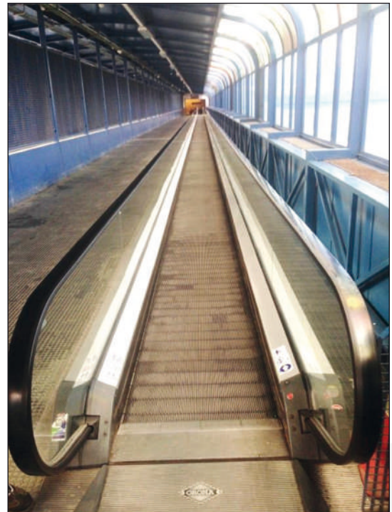
Passenger terminal moving walk, Port of Algeciras