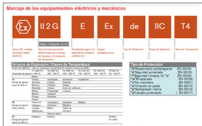
ATEX Directive, for manufacturers