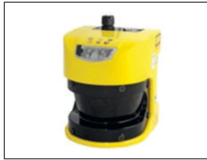
Safety Laser Scanner